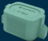
GPN 380 B