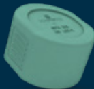
GPN 385 B