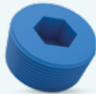
Screw Plugs GPN 720 A