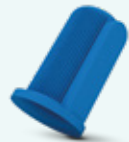
Shaft Protection GPN 290