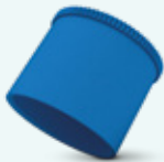
Protective Caps GPN 200 A