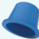
Universal Protection GPN 610