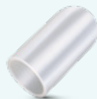
Protective Caps GPN 255