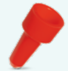
Screw-in Plugs GPN 550