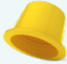
Universal Protection GPN 610