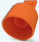
Grip Caps GPN 220

Reduction of the GHG emissions up to 31 %