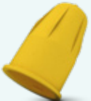
Protective Caps GPN 240