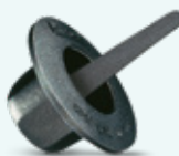
Grip Plugs GPN 630