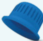
VDA Sealing Caps GPN 242