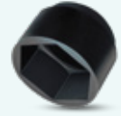
Hexagonal Caps GPN 1000