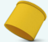
Protective Caps GPN 200 A