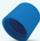
Protective Caps for Pipes GPN 250