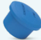
Closures GPN 350